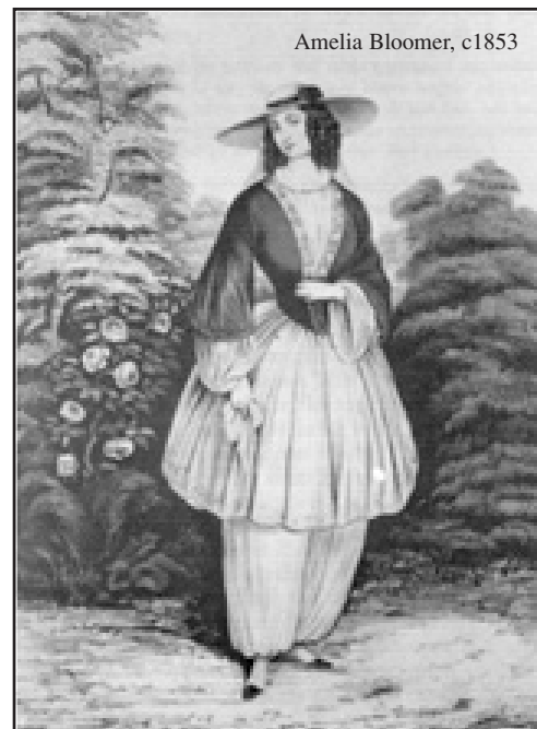
Amelia Bloomer, c1853

Corsets of various complexity came in and out of fashion through the Victorian era - sometimes worn under bodices that were nearly as "architectural" and rigid as the underwear. There were, of course, many warnings about the adverse effects of such restricted clothing - some quite true, and some more sensational. And so, in certain circles, there was a rebellion against the stiff high-fashion. The eponymous "Bloomers" - credited to Amelia Bloomer in the mid-1850s - were a reaction to the heavy sculpted dresses with billowy soft pantaloons instead - and worn under short skirts (just under the knee!). (They