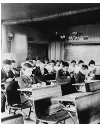
"School days, school days - Dear old golden rule days!" Music by Gus Edwards; Lyrics by Will D. Cobb, 1907

July 29: Sir Robert Baden-Powell forms Boy Scouts in England