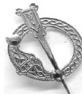
Reproduction of the ancient Tara Broach