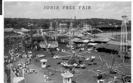
(Below) View of the midway at a Free Fair in the 1960s - a postcard found on eBay!