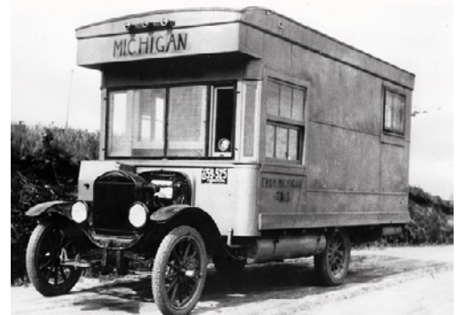
Yes, the Model T came in many forms - some from the factory and some hand-built modifications!

The meeting was adjourned at approx. 8:45 p.m.