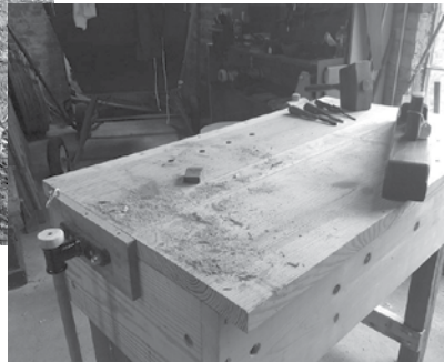
BELOW: The Carriage House workshop is actually being used as a workshop. Cleaning up antique tools and other artifacts has generated some sawdust. Signs of productivity!