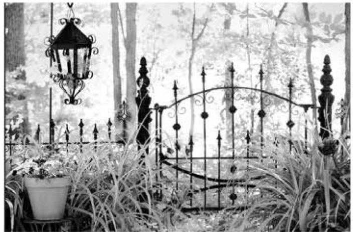
This gate once stood in the front of the Historic Blanchard House in Ionia Michigan. It now stands proudly behind a log cabin home in Lowell.